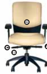
Advanced synchro (A)

Optional seat depth adjustment (not visible in photo) provides proper lumbar contact and lower body support