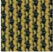
Tree moss (5299)