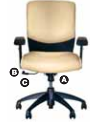
Swivel tilt (T)