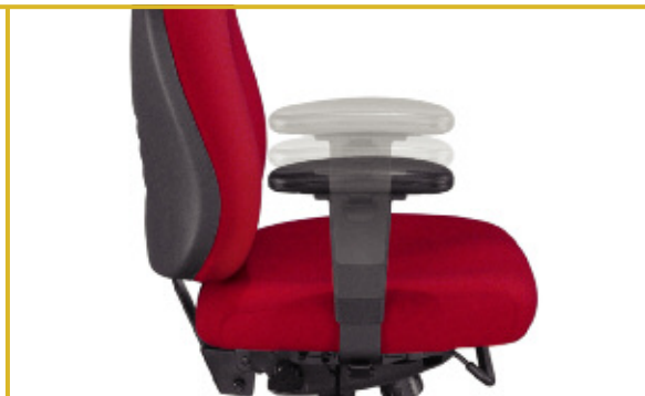
Vertical only height adjustable only arm package