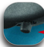
Adjustable Lumbar Support - B