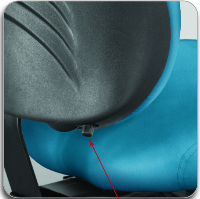
YB33 099 77 - Adjustable Lumbar Support Notice the B as part of the product number when ordering the adjustable lumbar support option.