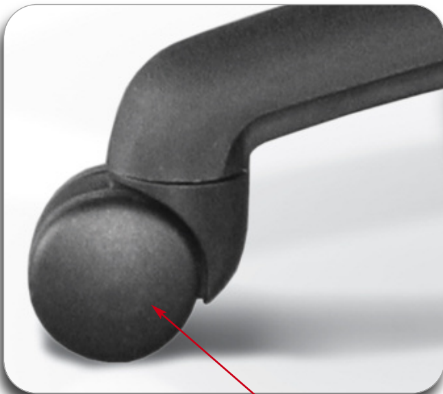
Y133 099 77K - Soft Dual Wheel Casters Notice the K as part of the product number when ordering the soft caster option.