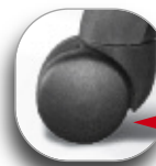
Soft Casters - K