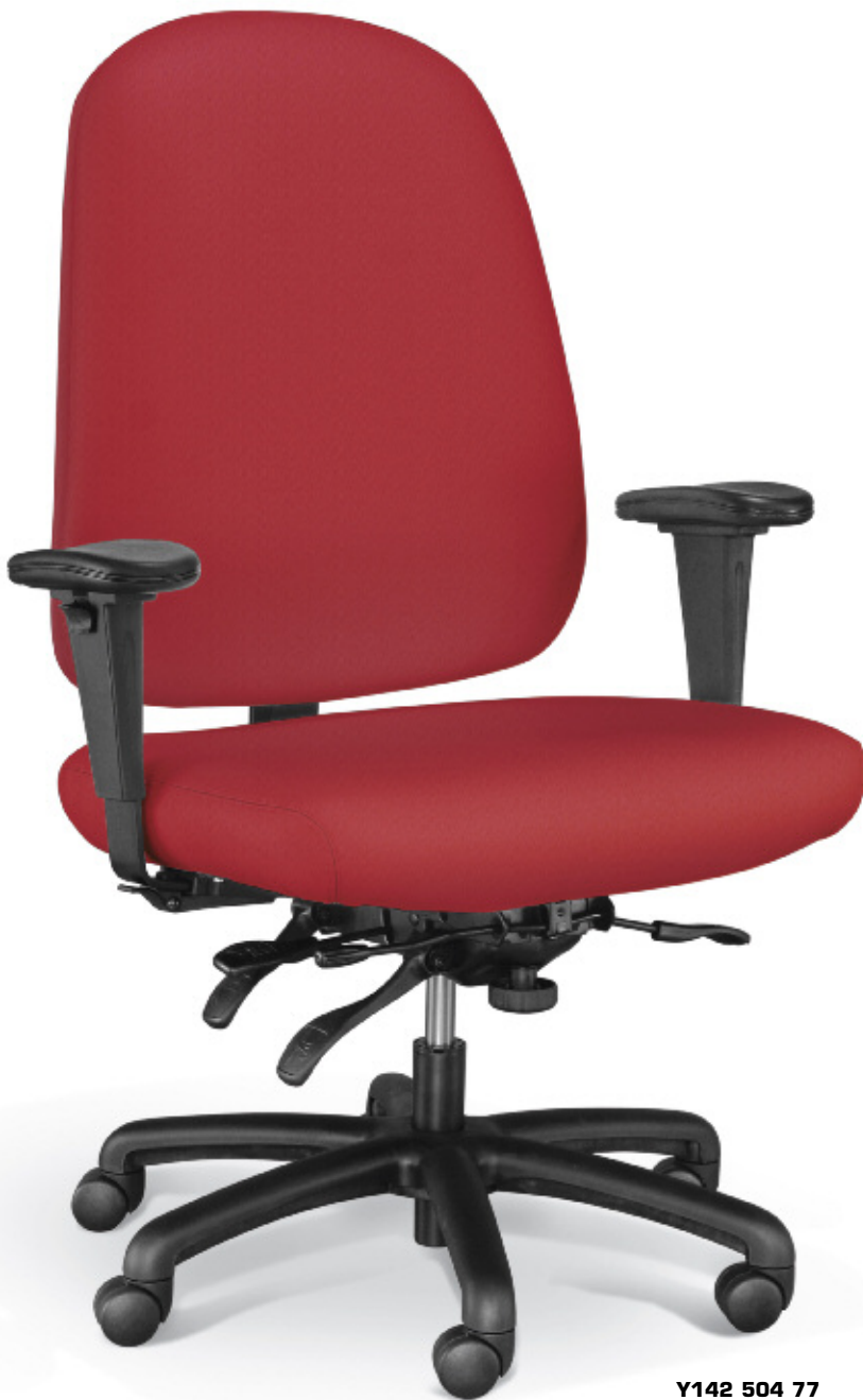
Y142 504 77

Genesis Big & Tall is an amazing combination of durability, comfort and value. Genesis Big & Tall was built to accommodate users up to 500 lbs. and the demands of heavy duty use situations. 25" seat width, 21" seat depth, 25" back width and a 27" back height. This chair easily handles the requirements of 24 hour aggressive use and specialty applications. Features include; heavy duty intensive use mechanism, a fully adjustable arm option, die cast aluminum ratchet back height adjustment mechanism, six prong molded base, heavy duty pneumatic cylinder and casters. Also available is a 2.5" seat slider option.