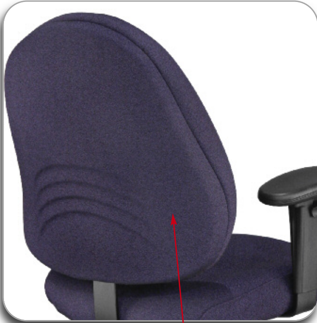
Y133 099 77U - Upholstered Outer Back Notice the U as part of the product number when ordering the upholstered outer back option.