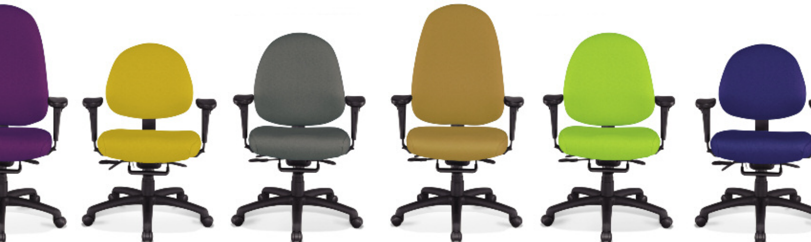
Y127 142 77 (without casters)