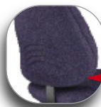
Upholstered Outer Back - U