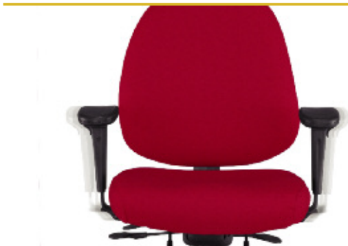
Height and width adjustable arm packages