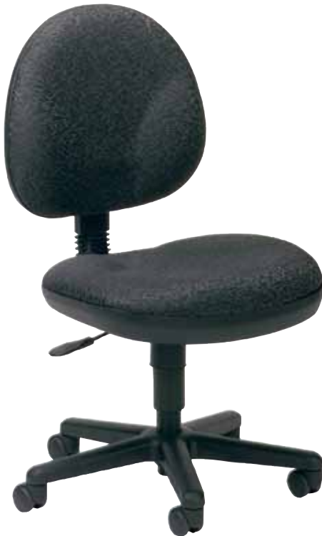
500 Armless Sketch 812 Carbon