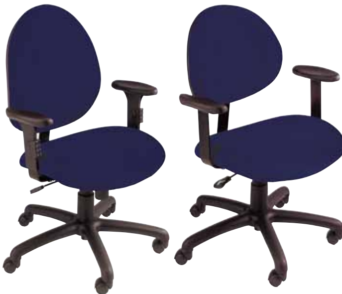
321SM30AT High Back Task