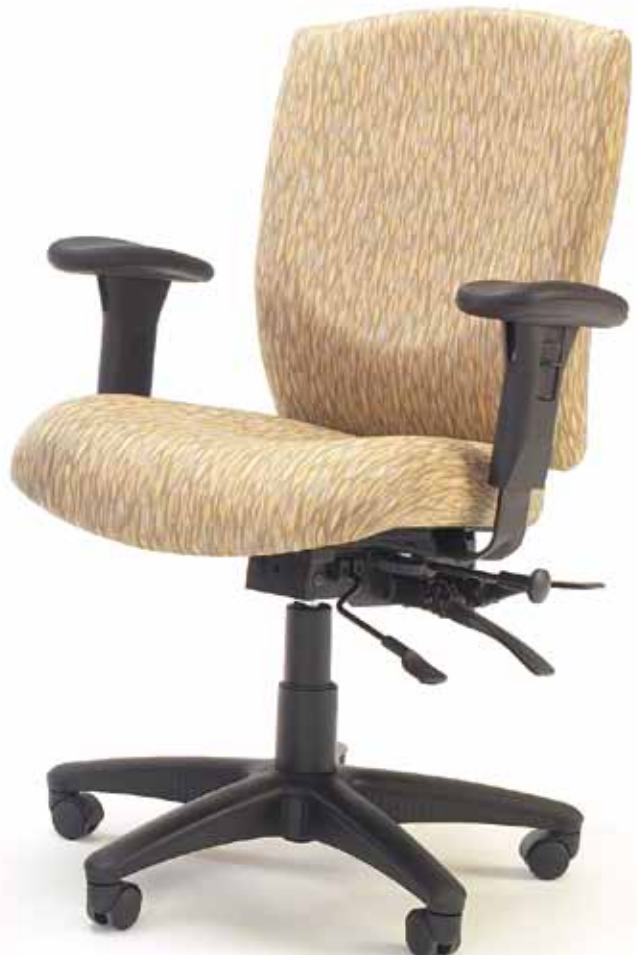
621 Executive Swivel Syncopation 10 254-001 Chili 627 Management Swivel Syncopation 10 254-007 Desert