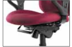
330FM30AL 20" High Back

Optional Sliding Seat Mechanism allows adjustment of seat depth to the individual user. Seat slides forward/backward. Order FMSS ; see price list for upcharge.