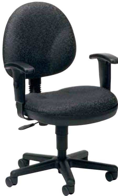
50050AT Adjustable T Arms Sketch 812 Carbon