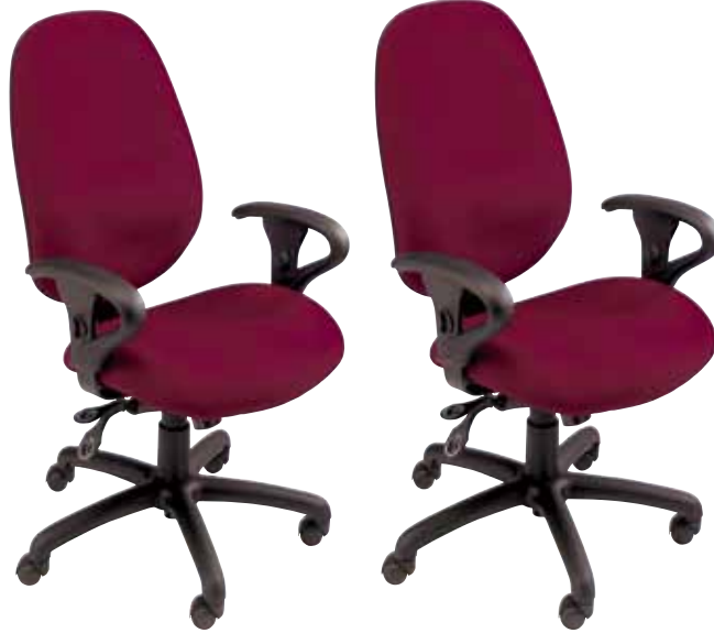
331YM30AL 24" High Back