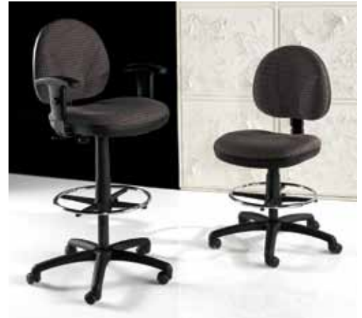
59050AT Adjustable Arms 590 Armless Perk 970 Walnut

For window tellers, draftspersons, engineers and more! High-value Cheetah chair with 10" vertical height adjustment – both seat and footring. Seat height 24" - 34" range. Upgraded extra-wide base for stability. Glides as well as multiple caster options available.