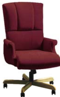
Fully Upholstered Arms & Base

Trifecta 1600 Series presents executive-level style and comfort in three distinct appearances: Fully Upholstered, Wood Arms/Base and Black Textured Resin Arms/Base. Available in hundreds of fabrics and nine wood finishes. Pronounced backrest and lumbar support enhance comfort. Seats feature thick, multi-density foam and seat suspensions that conform to the individual. Waterfall front seat edges provide proper leg support. Standard 360-degree swivel with tension and manual height adjustments. Standard Pneumatic Lift and optional Knee Tilt increase comfort. Quick Ship available in 50+ fabrics. All chairs include Lifetime Limited Warranty.