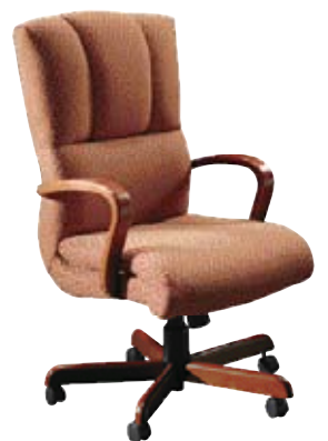
Wood Finish Arms & Base