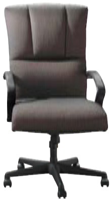
Black Textured Resin Arms & Base (All chairs shown in FM Natural finish)

At Right: Contempo Guest Seating offers elegance and design to compliment Trifecta. Wood or Upholstered Back. Curvilinear, Sloped or Scalloped Arm styles.