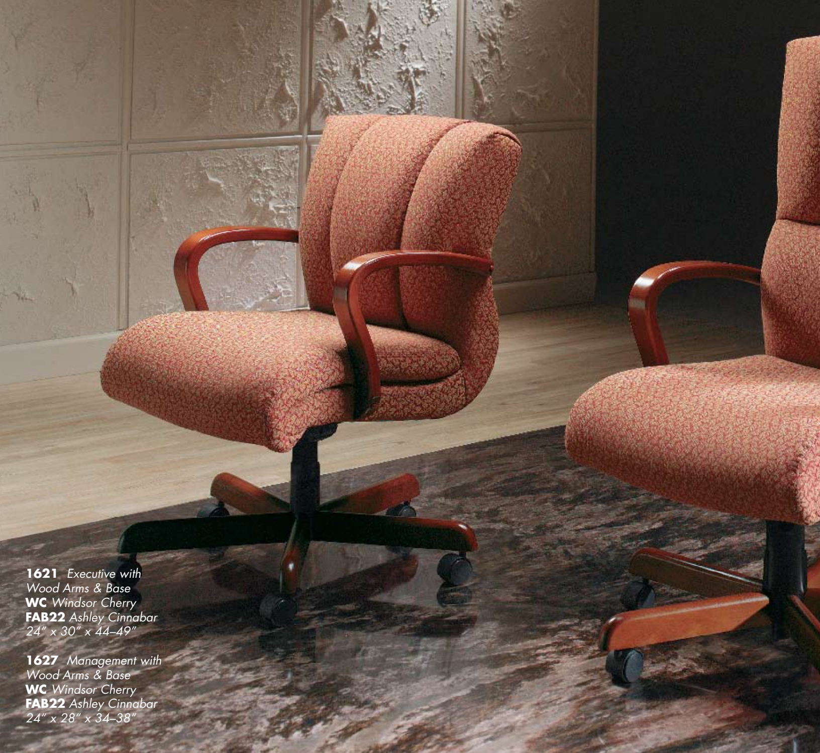
1621 Executive with Wood Arms & Base WC Windsor Cherry FAB22 Ashley Cinnabar 24" x 30" x 44-49"