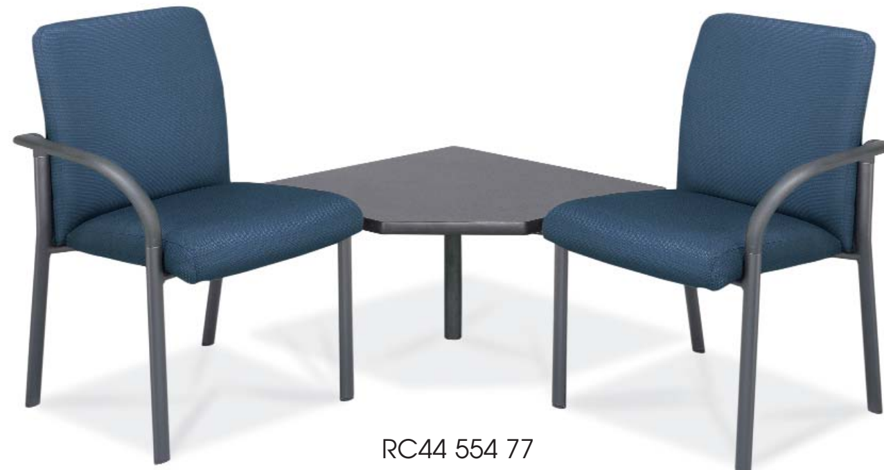
X945 50R 77