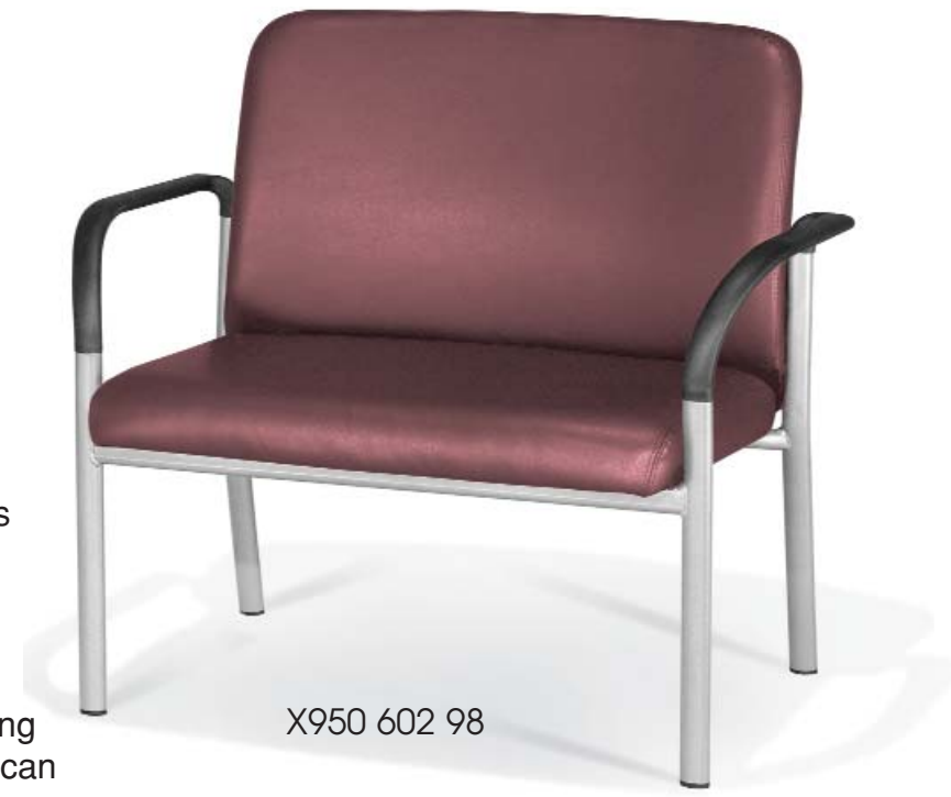
X950 602 98