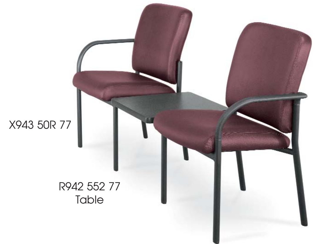
X943 50R 77