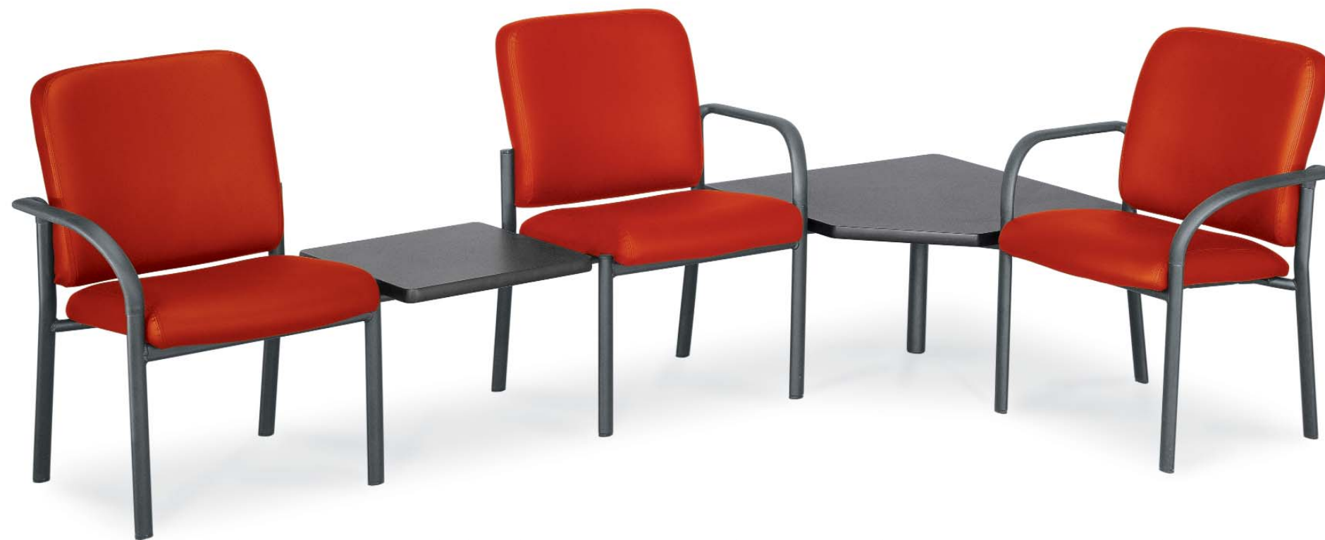
X943 50R 77