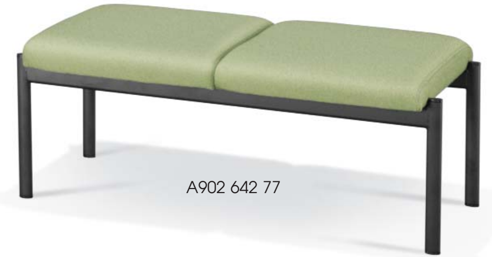
A902 642 77