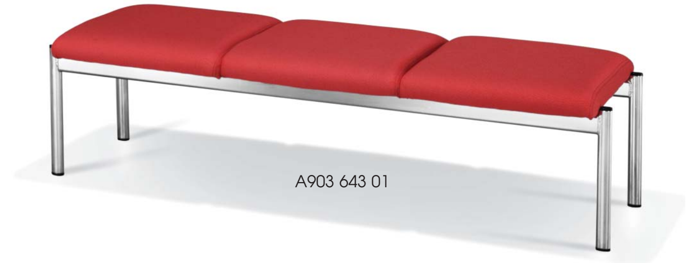
A903 643 01