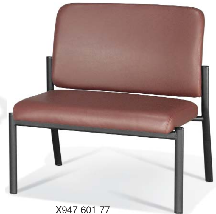
X947 601 77