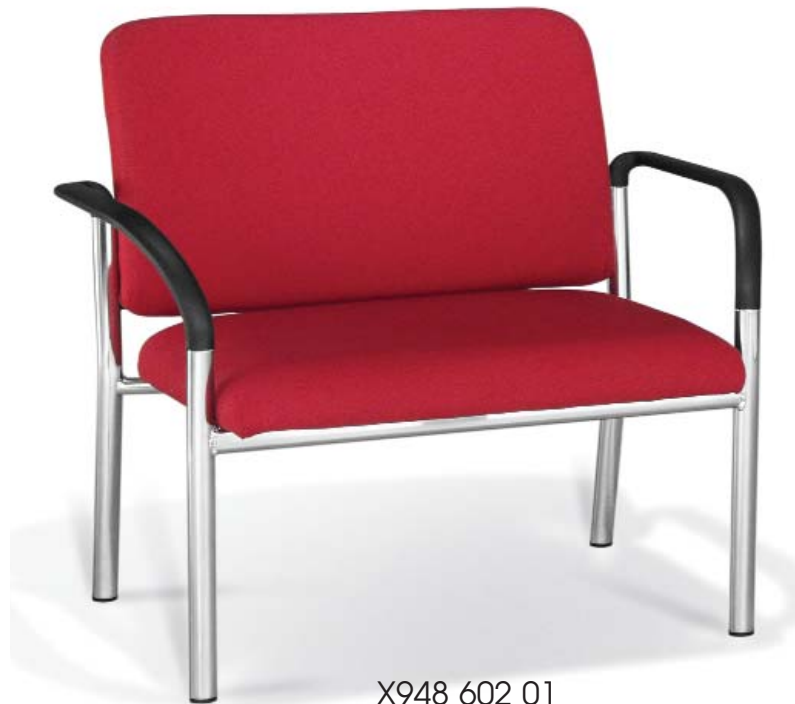
X948 602 01